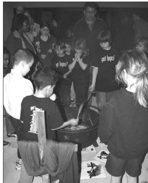
The burning of palm fronds before the Ash Wednesday service.