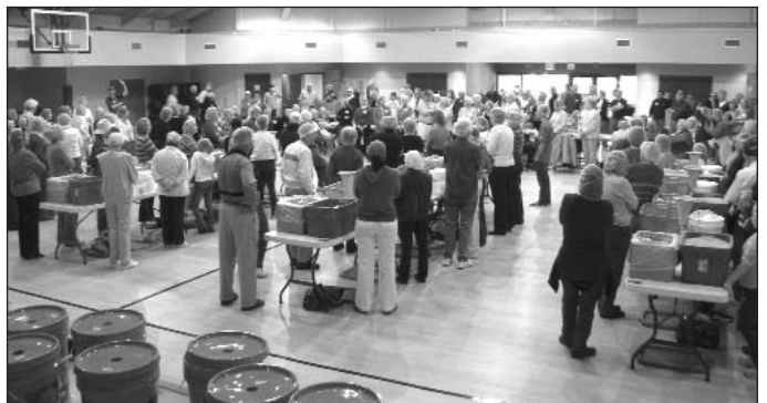
200 volunteers, at the first of three shifts, listen to directions before they begin the process of preparing, bagging and packing food.